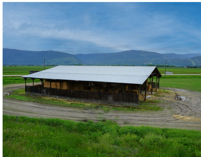
Figure 1: Farm Utility Structure

Whether you seek to expand your existing farming operations or embark on a new agricultural 1680 Nicks Road offers an unparalleled canvas for your aspirations. Seize the opportunity to acquire this exceptional piece of land, and unlock the untapped potential that awaits within the bountiful Creston Valley.