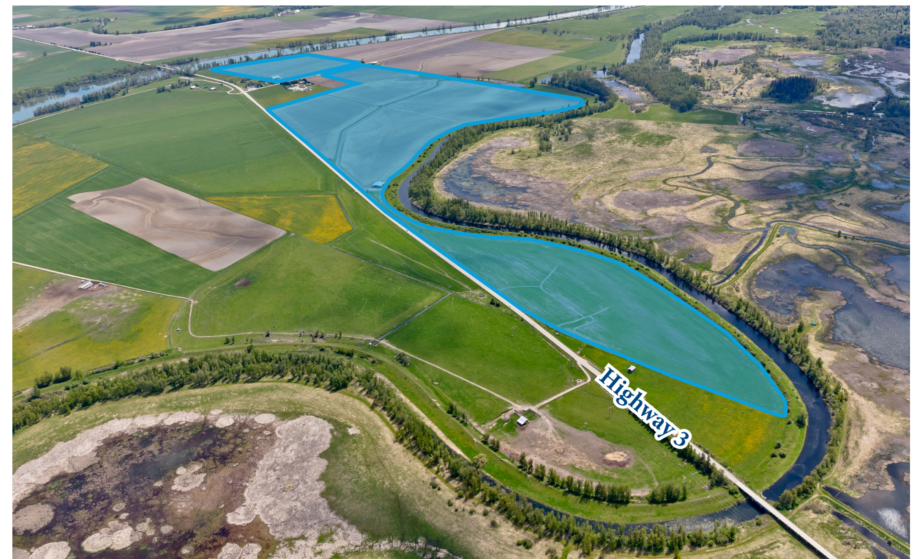
Figure 4: Aerial Land Parcel