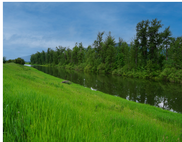
Figure 2: Kootenay River