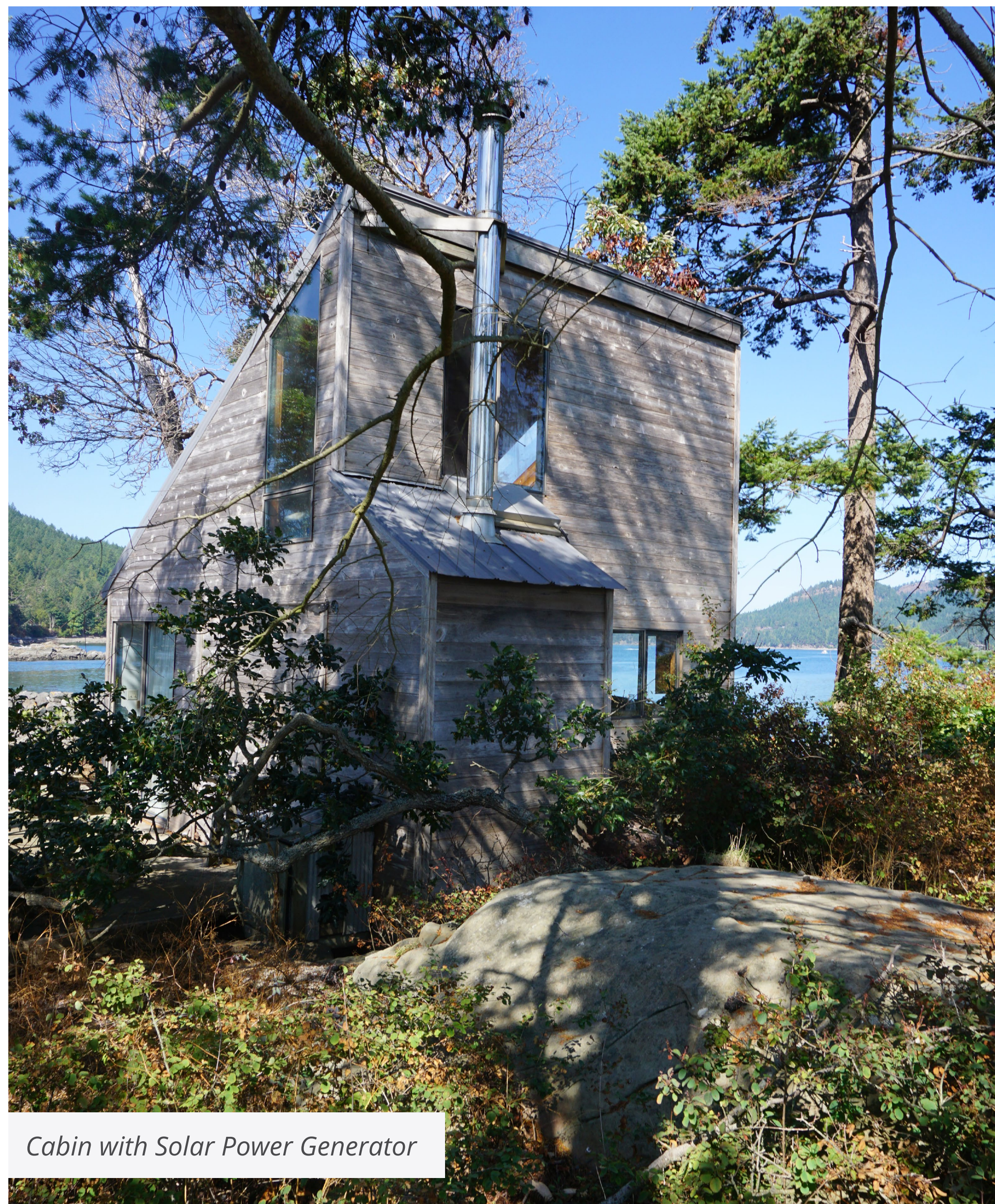
Cabin with Solar Power Generator